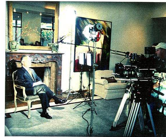
Filming former Governor of Oklahoma, David Walters, for The GET Documentary